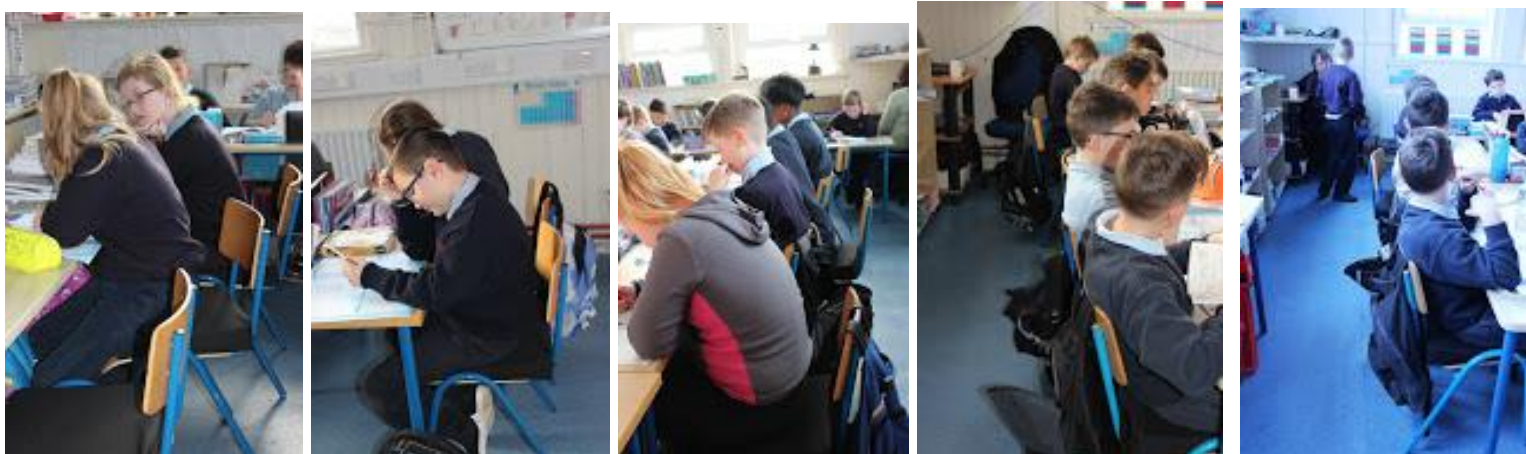
Pic 4. Claddagh School second 4 th Class – no wedges given to pupils (pictures taken 13/1/16 and 1/3/16)